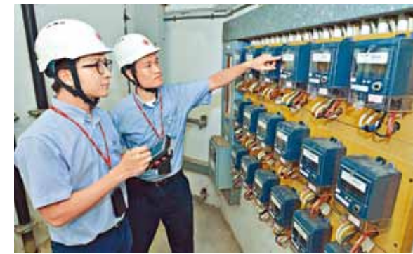
Smart meter is one of HK Electric's initiatives to transform HK

With ongoing innovation efforts, HK Electric has been able to achieve excellent supply reliability in the past two decades. The Company has maintained a world-class power supply reliability rating of over 99.999% since 1997. HK Electric has also been continuously improving in this aspect with the average power interruption dropping to less than one minute per customer per year for the last ten years.