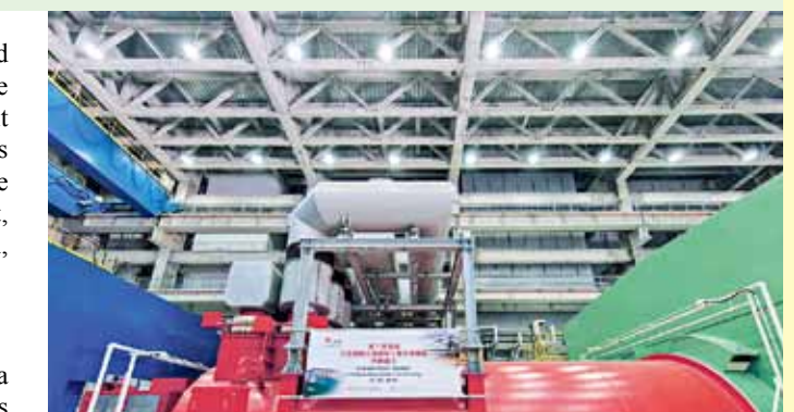
The synchronisation of the new gas-fired unit L10 marks a major step forward by HK Electric in its transition from coal-to-gas generation.

HK Electric's commitment to safeguarding the environment is articulated in its Environmental Policy where there is renewed emphasis on low-carbon power generation and support for the community in the wider application of renewable energy (RE). Environmental considerations are fully integrated across all areas of business in compliance with comprehensive environmental and energy management systems certified to ISO 14001 and ISO 50001, respectively.