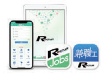
Recruit Mobile Apps